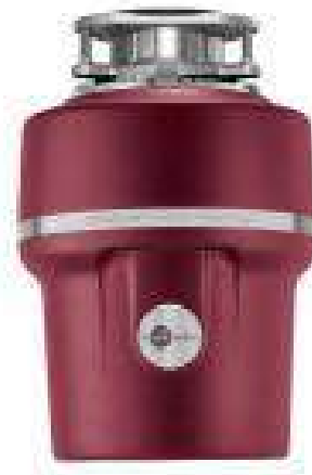
Evolution 3/4 HP: