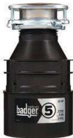
Badger 5 1/2 HP: