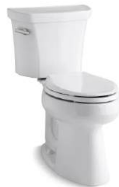
Wellworth Standard, Round Bowl: