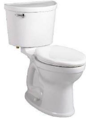
Champion Pro Tall, Round Bowl: