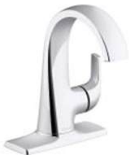
Cursiva Chrome: $545 Installed