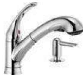
Delta Foundations: $485 Installed