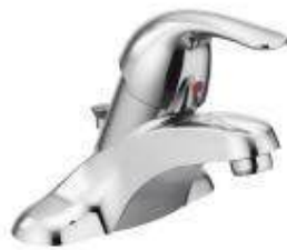
Adler Chrome Single Handle: $430 Installed