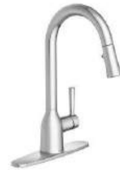
Adler Brushed : $520 Installed