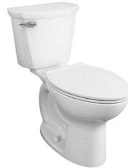
Cadet Pro Tall, Round Bowl: