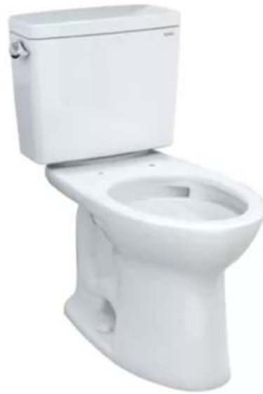
Toto Drake Tall Elongated: