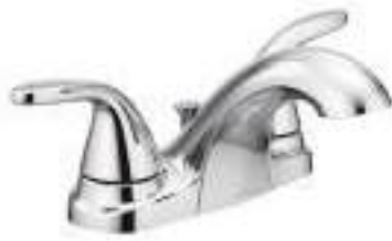
Adler Chrome Two Handle: $420 Installed