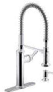
Sous Pro Stainless Steel: $725 Installed