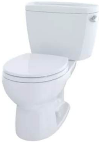
Toto Drake Tall Round: