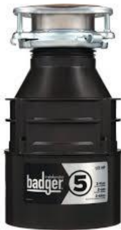
Badger 5 1/2 HP: