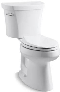
Wellworth Standard, Round Bowl: