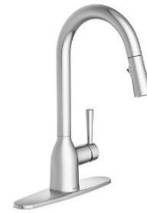
Adler Chrome: $470 Installed