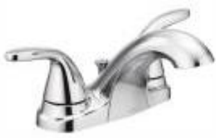
Adler Chrome Two Handle: $379 Installed