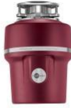
Evolution 3/4 HP: