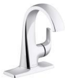
Cursiva Chrome: $495 Installed