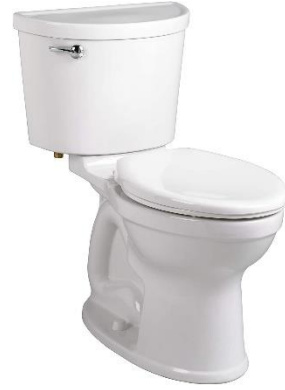
Champion Pro Tall, Round Bowl: