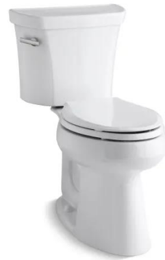
Highline Tall, Round Bowl: