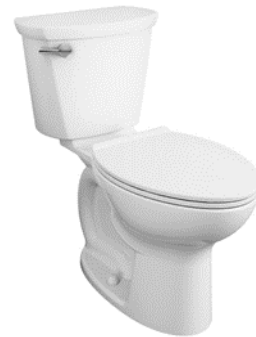
Cadet Pro Tall, Round Bowl: