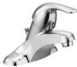
Adler Chrome Single Handle: $389 Installed