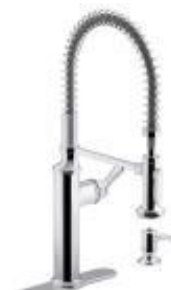
Sous Pro Chrome: $605 Installed